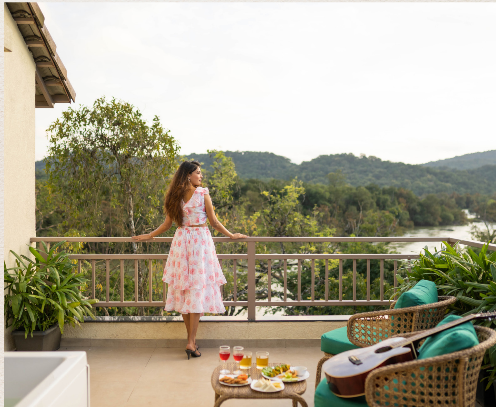
Executive Deluxe | Executive Room | Riverside Room