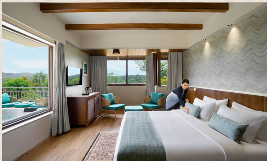
Executive Premium Cottage | Executive Room Twin Bed | Executive Suite

A unique blend of luxury and heart-winning service, all made better with picturesque landscapes and ideal weather, you will be spoiled for choice when it comes to the stay options.